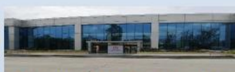
School of Life Science, UH